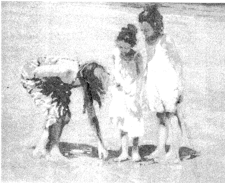
Figure Q2 (c)

Considering all requirements of your family, transform your existing garden as given in Figure Q5 (c) to a useful and very cheerful garden with the help of your design skills and the knowledge of design theories. Your design should be done on the sheet provided with Figure Q5 (c) and it should be attached with your answer scripts. [12 Marks]