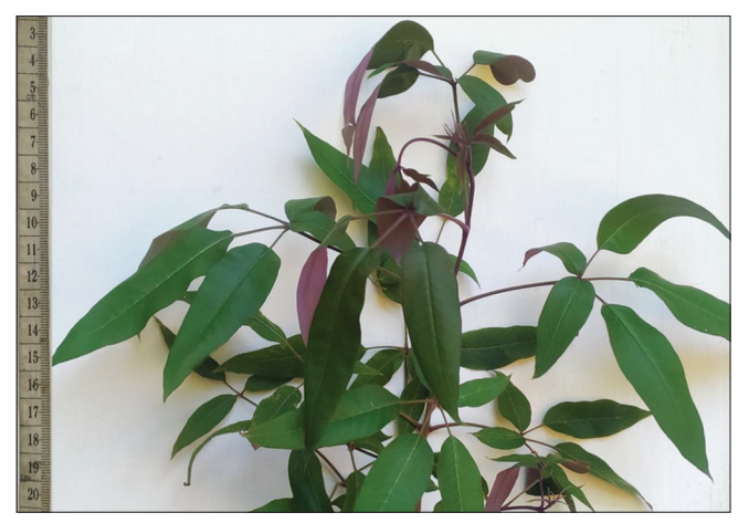
Figure 1: Leaves of Litsea iteodaphne . Local name: "Kalu Nika"; Family: Lauraceae