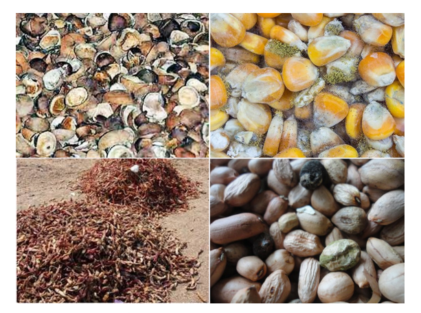
Figure 2: Occurrence of aflatoxins in food crops

can also be contaminated and afflicted with AFs due to improper storage and processing conditions. Furthermore, the presence of AFs in eggs collected from a poultry farm and in raw cow milk in Cameroon was reported by Tchana et al. (2010). Due to this, the affected crops contribute to the entry of AFs into the food chain, which is strongly dependent on climatic conditions. The occurrence of aflatoxin food products in varies geographically and the toxicity in particular food products depends on the frequency of consumption by different ethnic groups and nations.