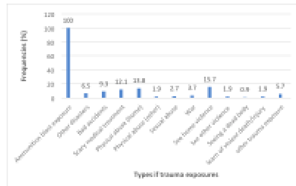
Figure 2. Self-reported exposure to prior trauma.

difference was not statistically significant \chi^2(1, N=108) = 1.61 p=.20 ). A majority (98.1%) described the Salawa ammunition blast as the worst traumatic experience in their life.