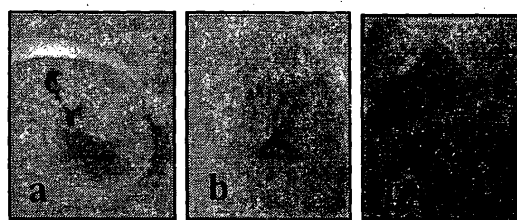
Figure 1: Effect of different sterilization methods on appearance of leaf discs: a. 20% Clorox for 15 minutes, b. 25% Clorox for 15 minutes and c. 25% Clorox for 20 minutes

In this experiment, three different concentrations of Clorox with different exposure time periods were tested. After 21 days of incubation, percentages of contaminated leaf discs were observed. Fungal contamination was observed as hyphal growth from the explants and bacterial contamination was identified by observing colonies, seen as watery or slimy buildups on the agar.