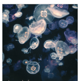
Journal of Marine Biology