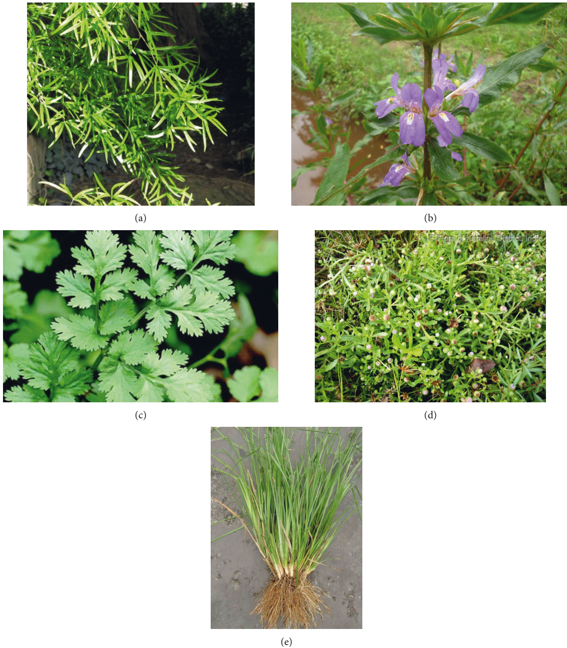
FIGURE 1: Photographs of plants used in the study. (a) Botanical name: Asparagus falcatus ; local name: hathawariya; family: Liliaceae. (b) Botanical name: Asteracantha longifolia ; local name: neeramulliya; family: Acanthaceae. (c) Botanical name: Coriandrum sativum ; local name: koththamalli; family: Umbelliferae. (d) Botanical name: Epaltes divaricata ; local name: heen mudamahana; family: Compositae. (e) Botanical name: Vetiveria zizanioides ; local name: sewendara; family: Graminae.

extracts were filtered, and the solvent was evaporated using a rotary evaporator. The extracts were resolubilized with 10% DMSO and stored at 4°C in air tight bottles for further studies.