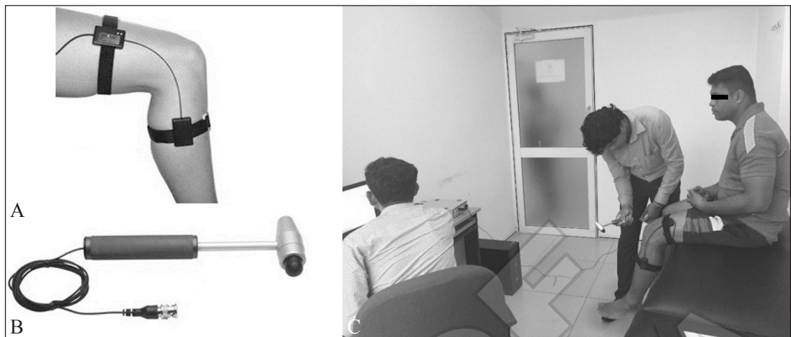
Figure 1.—A) Fiber optic goniometer; B) electronic tendon hammer; and C) the procedure of collecting data using the equipment.

when a surface is struck with the hammer which triggers the recording.