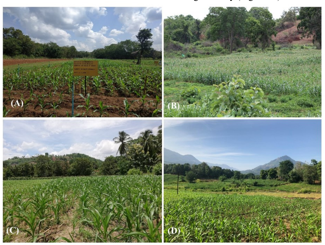
Figure 1: Agricultural lands (Maize cultivations) from which Spodoptera frugiperda larvae were collected. (A) Mahailuppallama (B) Polpithigama (C) Rideemaliyadde (D) Meegahakiula

The third instar stage is larger than the second instar stage with a body length ranging from 5.1 - 7.8 mm and a head capsule width ranging from 1.0 - 1.3 mm (n=140). The dorsal surface of the body is brownish-green with the appearance of white lines extending along the body (Figure 2c).