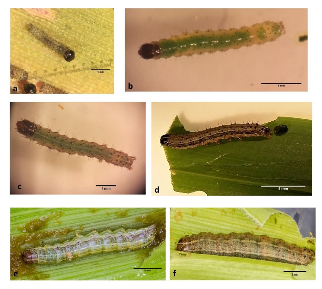
Figure 2: The six larval instar stages of Spodoptera frugiperda . a – First instar; b – Second instar; c – Third instar; d – Fourth instar; e – Fifth instar; f – Sixth instar