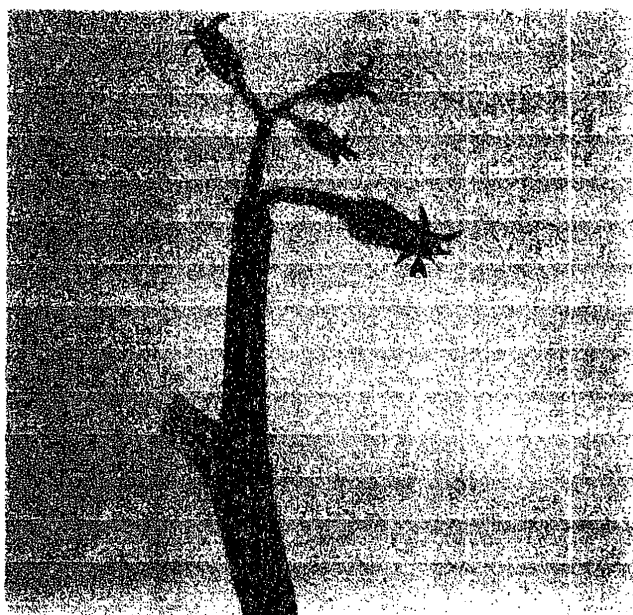
Fig. 1. Four-flowered inflorescence of eggplant. A, first flower bud with strong pedicel in a solitary position

were below anther tips, showing no variability between accessions except in 02270, which had stigmas more extended than anther tips, in both first flower and cluster flowers. Also, stigmas of cluster flowers were very rudimentary compared to the stigma of first flower except in accession 02270. Fig. 2 shows the variability for stigma position.