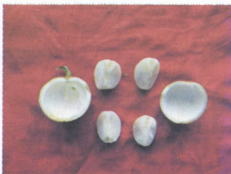
Fruit peel and pulp