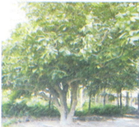
Burmese Grape tree