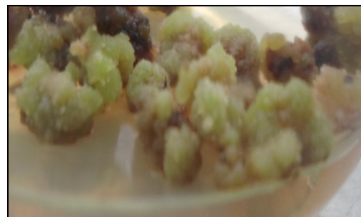
Figure 03: Highly compact, hard, nodular, fast proliferating and chlorophyllous callus produced from leaf ex-plant

by 0.5 or 1.0 mg/L of BAP combined with 1.0 mg/L 2, 4-D and 4.0 mg/L NAA. This highly compact, hard, nodular, fast proliferating and chlorophyllous callus (Figure 03) was transferred to regeneration media, 4 weeks after culture initiation.